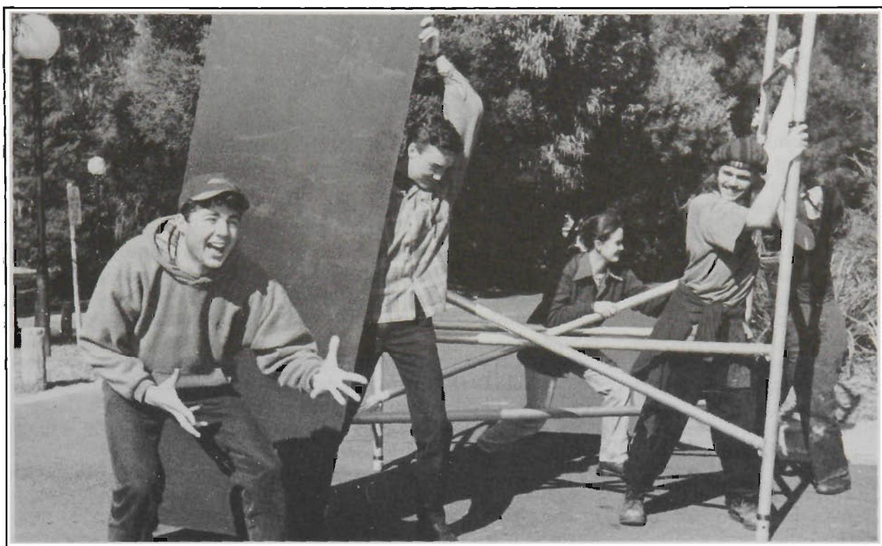
Students train for the Theatre Olympics