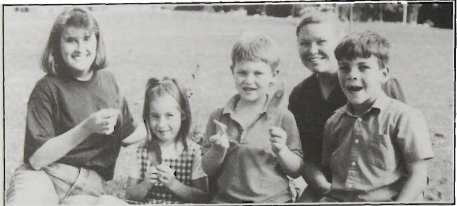
Pupils and student teachers display some of the 'treasures' they learnt about in the environmental studies class