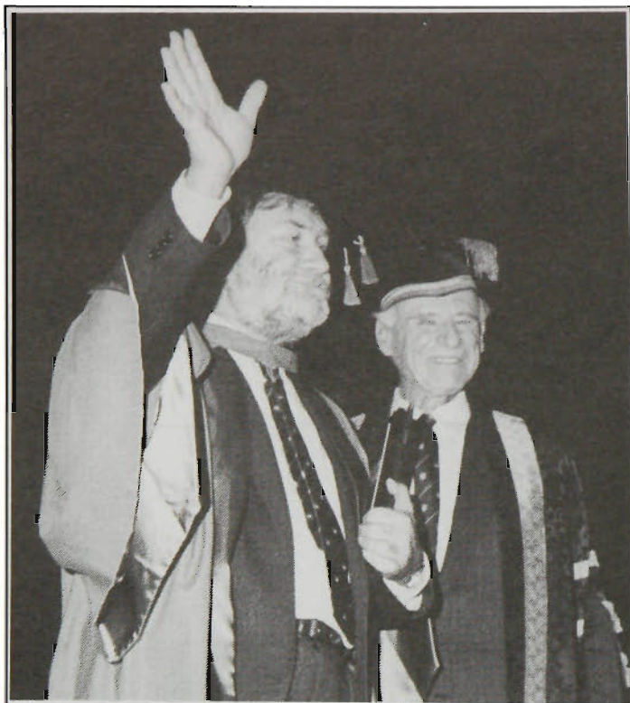
Professor Barry Jones, Visiting Professor at the University, politician and National President of the Australian Labor Party, was awarded a Doctor of Letters (honoris causa) for his seminal publications on historical, social and scientific change and his visionary contribution to the Australian community.