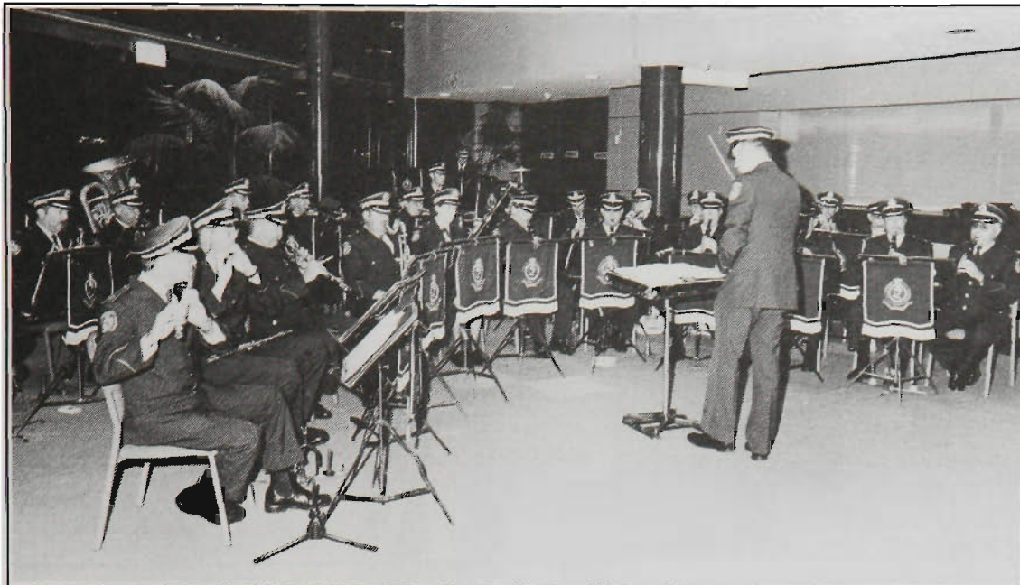
The Police Band added a welcome note to the graduation ceremony which included 56 senior police officers.