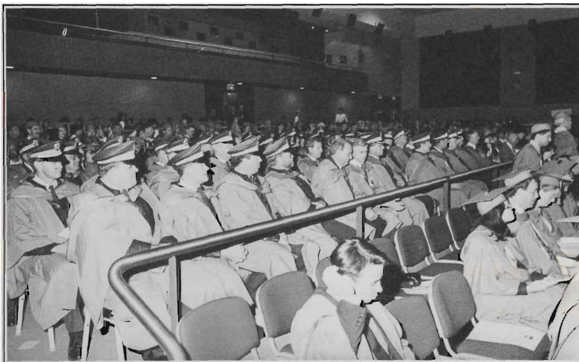
Graduands who successfully completed the Graduate Certificate in Management held in conjunction with the Goulburn Police academy wait their turn to receive their testamurs from the Chancellor.