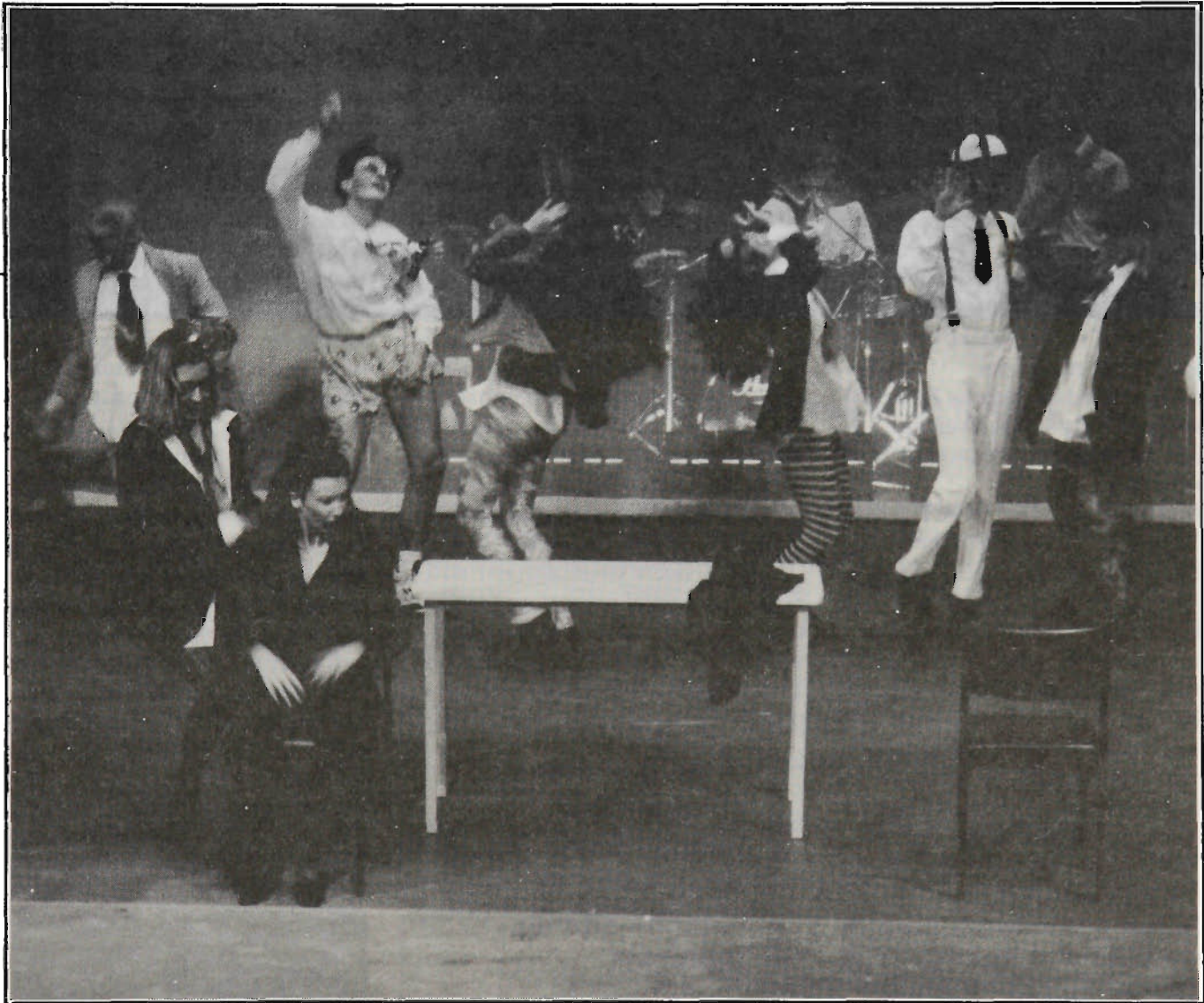
The 1992 Law Revue

The funding, which was based on recommendations by the Committee for the Advancement of Tertiary Teaching (CAUT), is worth more than $230,000 to the University.