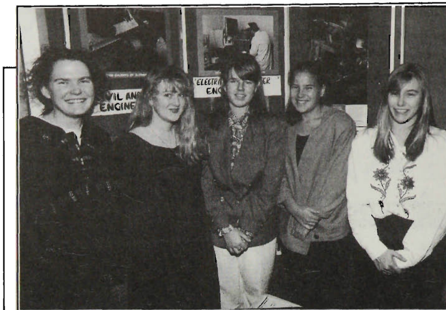
The recipients of Women in Engineering bursaries