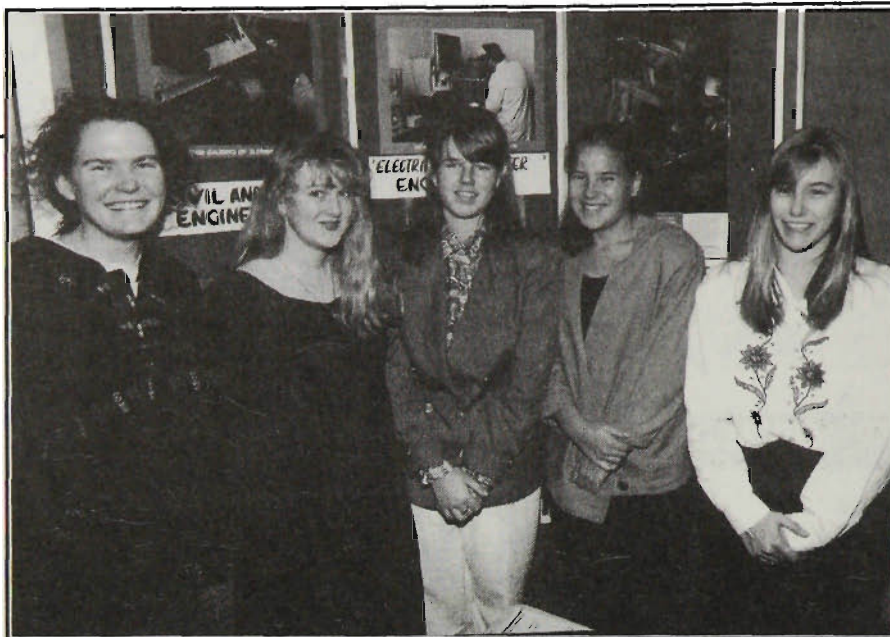
The recipients of Women in Engineering bursaries