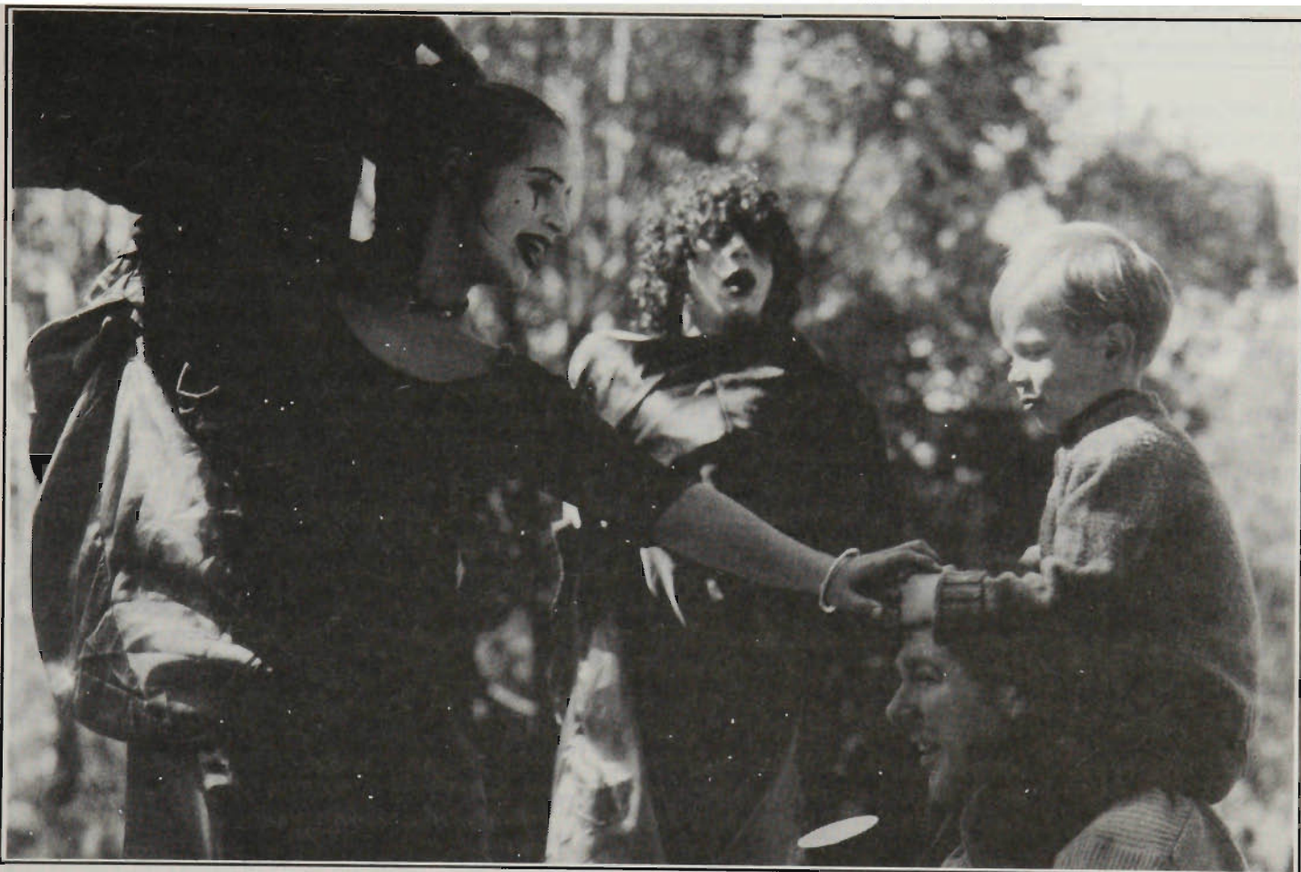
1992 Open Day. The next century's students learn that university can be fun

The University's Open Day will be held at the end of this month and, as in the past, visitors are expected from all parts of NSW with some from other states.