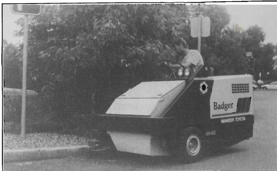
The new ride-on sweeper