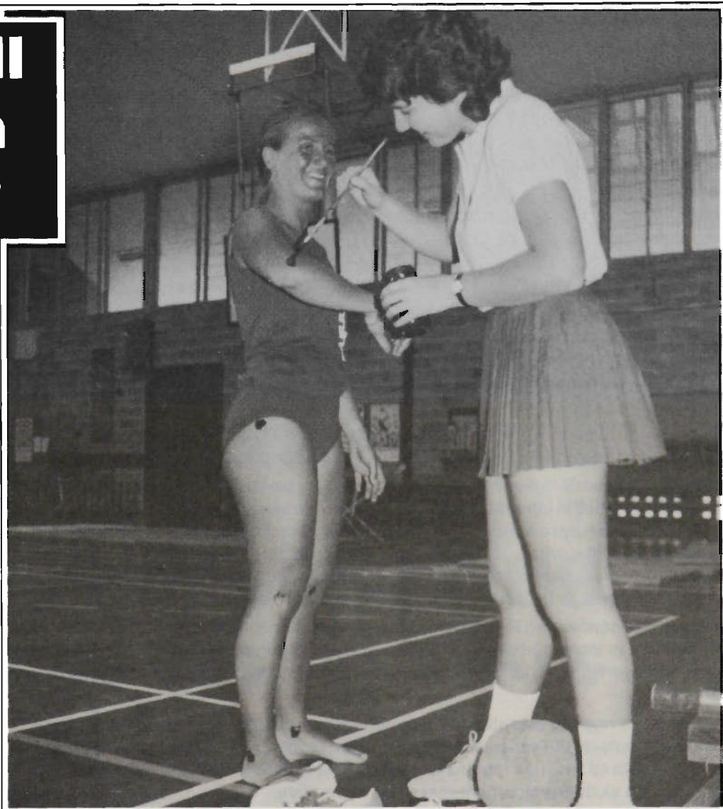
Preparing for research into netball injuries.