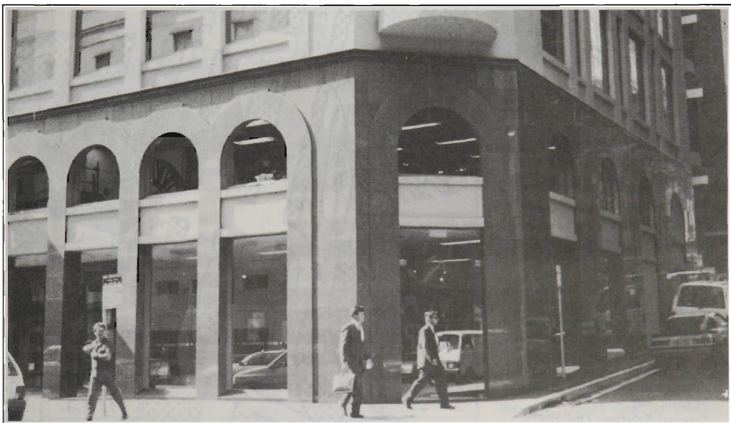
The University Centre in Sydney

The University Centre is a joint initiative by Charles Sturt University, The University of New England, and the University of Wollongong to provide the highest quality promotional, administrative, conference and meeting facilities in the Sydney CBD for all staff and students at the partner institutions.