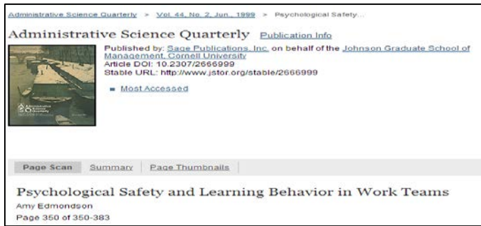
Figure 2 Actual reference details (volume has been switched to issue number and an incorrect volume number shown) http://www.jstor.org/stable/2666999 .

The students seemed genuinely shocked, but had no explanation for the differences. It seems that some ghost writers, or mills may alter aspects of legitimate references, so that the