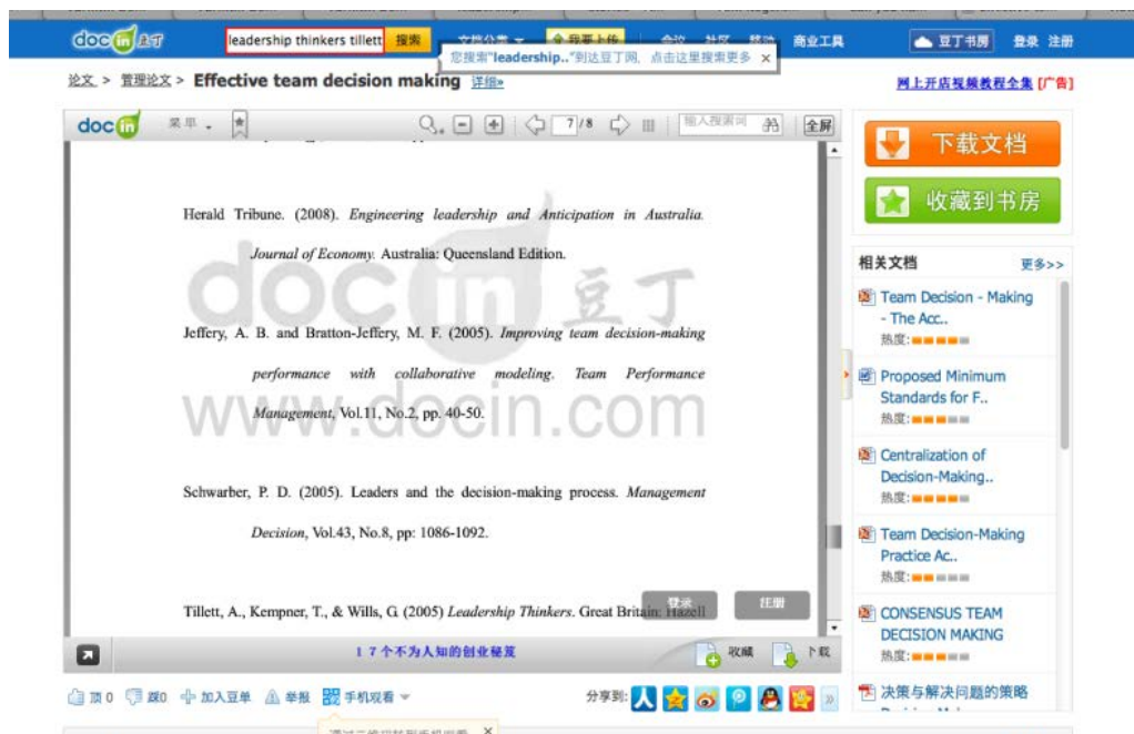
Figure 4 File-swapping website match