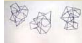
11. Robert Owen "Model for New Constellation"