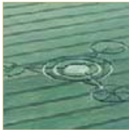
32. Adam Norton "Crop Circle 1"