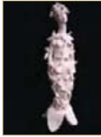
21. Andrew Blake "Figures of the Imagination"