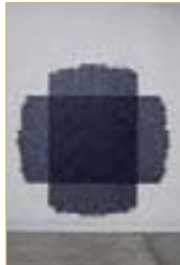
8. Hilarie Mais "Shaft"