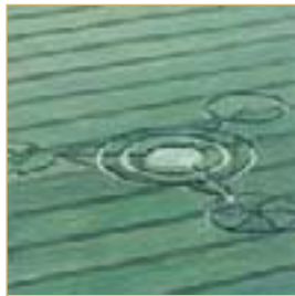
32. Adam Norton "Crop Circle 1"