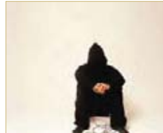
10. Vanila Netto "I'm a lousy frangipani"