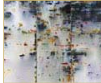
28. Julie Harris "Floating Skies 2"