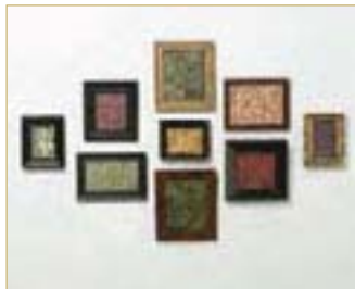
14. David Sequeira "Time and Space" One in a Series of 3