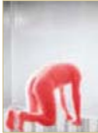
3. Pat Brassington "House Guest # 1" One in a Series of 3