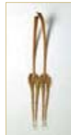
16. Hossein Valamanesh "Twins"