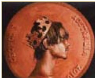
15. Darren Siwes "The Just and the Unjust" One in a Series of 3