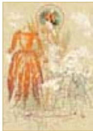
33. Nusra Qureshi "Beneath the Silks - I"