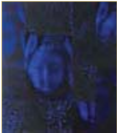
7. Lindy Lee "Traveling the Blue"