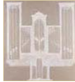
22. Mitch Cairns "Feature Organ"