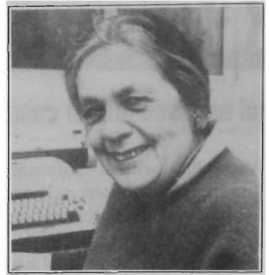
The late Olga Masters