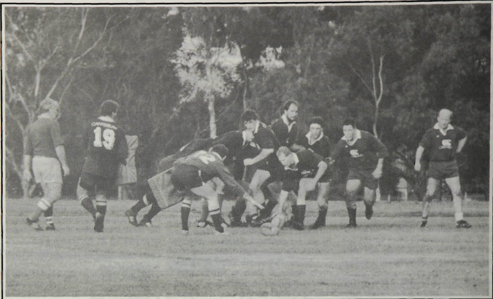
The Wallabies had their final training session in Wollongong before defeating France in the first Ricoh Test at Sydney Football Stadium (June 9)