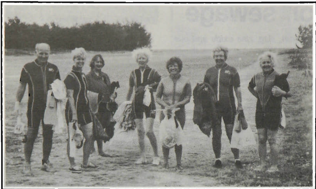
Fish behaviour snorkelling group about to get wet. Lady Elliot Island, University of Queensland Field School, out on a typical College for Seniors safari