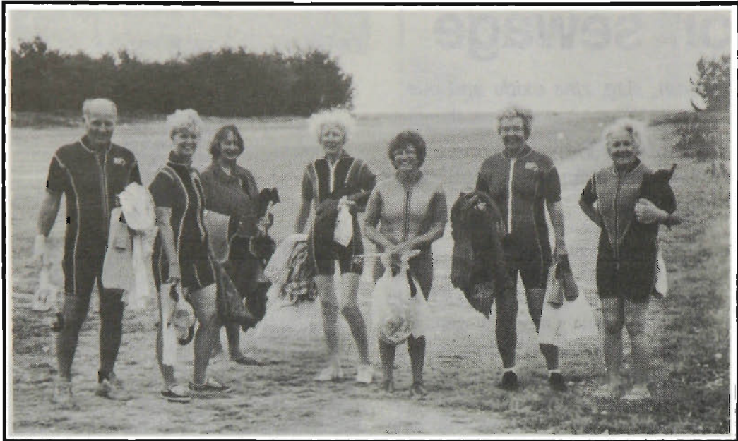
Fish behaviour snorkelling group about to get wet. Lady Elliot Island, University of Queensland Field School, out on a typical College for Seniors safari