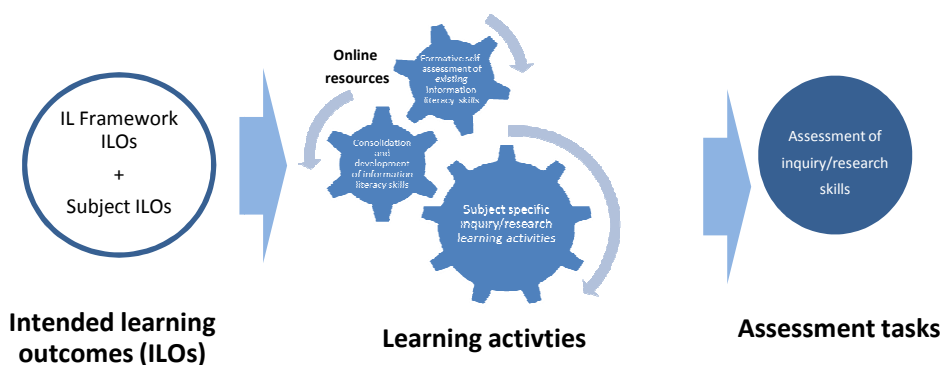
Figure 1: Using constructive alignment to embed information literacy into subject design

Key to the La Trobe model for embedding information literacy is ensuring that online resources developed by librarians are interrelated to subject elements, i.e. learning outcomes, activities and assessment. This has been achieved by designing online objects to specifically address intended learning outcomes in the La Trobe Information literacy framework (La Trobe University 2011b). This framework supports subject inquiry/research intended learning outcomes. It quantifies intended learning outcomes for each of the six framework standards across four levels of capability, and is based on the Australian and New Zealand information literacy framework, principles, standards and practice (Bundy 2004). Therefore the online resources form part of a logical learning system and the outcome is focused directly on student learning. Once embedded in the curriculum, these online resources provide students with an opportunity to recognise what they know and need to know, have a scaffold on which to build basic generic skills, and then practice those skills in discipline learning activities and receive feedback before attempting assessment tasks.