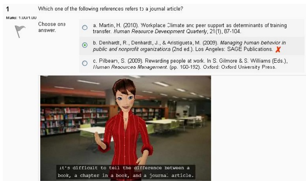
Figure 2: IRQ - question and feedback

The online IRQ is a formative self-assessment of existing skills and knowledge, and is designed to increase student awareness of the essential information literacy skills required for starting research at university. The IRQ includes a set of ten questions and is designed to be: a self-assessment, self-tutoring formative test of foundation information literacy skills; completed early in first year; related to the standards one to four and six of the La Trobe Information literacy framework ; implemented in a way that makes sense to the context of the specific subject requirements; auto-marked with feedback via online objects; and a method of directing students to appropriate and more in-depth online information literacy resources.