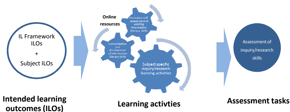
Figure 1: Using constructive alignment to embed information literacy into subject design

Key to the La Trobe model for embedding information literacy is ensuring that online resources developed by librarians are interrelated to subject elements, i.e. learning outcomes, activities and assessment. This has been achieved by designing online objects to specifically address intended learning outcomes in the La Trobe Information literacy framework (La Trobe University 2011b). This framework supports subject inquiry/research intended learning outcomes. It quantifies intended learning outcomes for each of the six framework standards across four levels of capability, and is based on the Australian and New Zealand information literacy framework, principles, standards and practice (Bundy 2004). Therefore the online resources form part of a logical learning system and the outcome is focused directly on student learning. Once embedded in the curriculum, these online resources provide students with an opportunity to recognise what they know and need to know, have a scaffold on which to build basic generic skills, and then practice those skills in discipline learning activities and receive feedback before attempting assessment tasks.