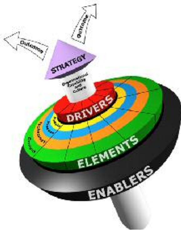
Figure 2 The Australian Interim Standard Model (AS 5037 Int)

The interim standard AS 5037 (int) was released in February 2003 as a “work in progress”, directed principally at managers and KM practitioners and was followed immediately by a process to collect feedback from the public on the document. The willingness of those in the KM community to provide their ideas and opinions has been encouraging and these are now being incorporated into the final standard, to be released late in 2004.