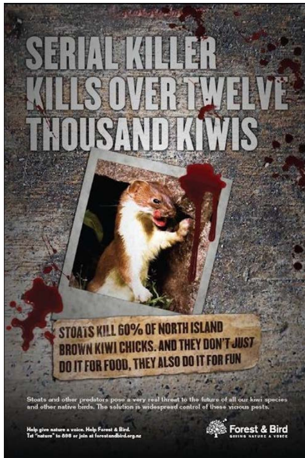
Fig. 2. Serial Killer Kills Over Twelve Thousand Kiwis.

that settlers imaginatively identify – in the first instance – with the animals they acclimatise as assistant or surrogate agents of sanctuary-making. The extreme persecution returned to the stoat through contemporary sanctuary-work bespeaks unease associated with the deeper knowledge that European settlers are Aotearoa/New Zealand's 'most formidable exotic intruder of all' (Lockley), and that settlers and their culture are what settlement still ultimately seeks to acclimatise.