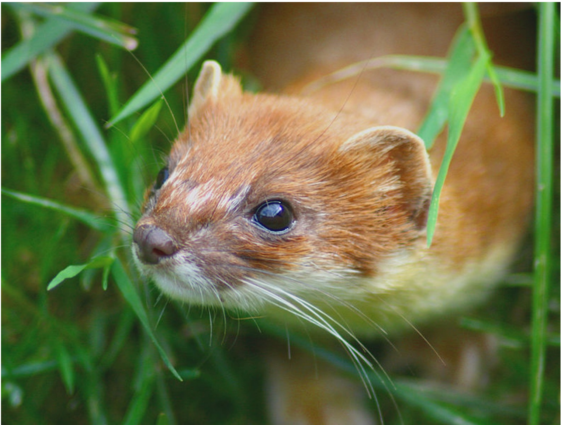
Fig. 1. Stoat (Mustela erminea).

campaign, which identifies the stoat as a prime target species, was launched by the New Zealand government as ‘the most ambitious conservation project attempted anywhere in the world’ (Kirk). This fifth claim to exceptionalism aims to address the crisis implied in the conjunction of the second and third claims as it protects what is presently valued in the first and extends the reach of the fourth. Reconfiguring the entire country as an island sanctuary for endemic species, it aspires to literalise the notion of Aotearoa/New Zealand as a ‘stoat-free state’.