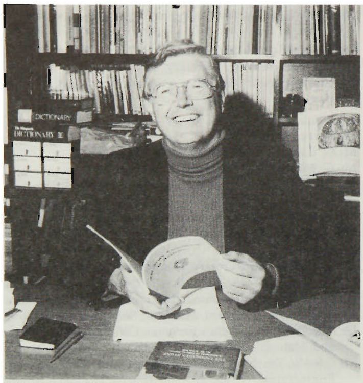
Coming to Wollongong on October 19 — Father Campion