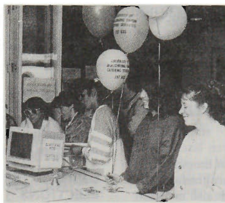
Staff at the Course Inquiry Centre were besieged throughout the day, dealing with inquiries from hundreds of tomorrow's students, about entry to the University