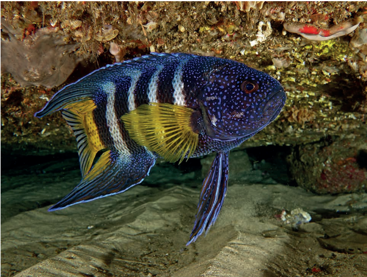
Figure 2: The eastern blue devil ( Paraplesiops bleekeri ) is a temperate cave-associated species that would not look out of place on a tropical reef. Brightly coloured and a prize sighting for divers; they are protected in New South Wales (Australia) waters because of their natural rarity and low abundance.

We know of no historical records in Australian museums or databases of eastern blue devil fish from deeper than 30 m either. Owing to a combination of their protected status and the complex terrain they inhabit, commercial fishers are unlikely to come across them, as trawling is avoided on these areas because of the risk of damage to nets. The vast majority of sightings and records of eastern blue devil fish are reported from divers and researchers. The accepted depth range of eastern blue devil fish and many coastal reef fish coincides with the recreational dive limits of ~30 m, despite the fact that