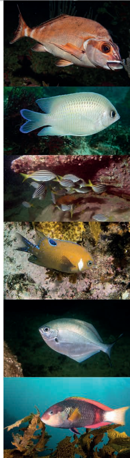
Figure 3: Five species (photos from top to second from the bottom are red morwong, immaculate damsel, mado, white-ear and silver sweep) that are common on shallow reefs and previously had an accepted depth range of <30 m were observed regularly on deeper reefs in this study (>50 m). Crimson-banded wrasse (bottom photo) was also observed outside their depth range on a small number of samples.

Once off the reef edge, the fish communities found on the surrounding sandy areas begin to change and are very different to those on the reef (Schultz et al. 2012). Our study area is no exception; the patch reefs at a depth of 50 m tend to be dominated by a range of more colourful or conspicuous species, whilst the surrounding sand habitats sampled in Fetterplace (2018) are dominated by flatheads (Platycephalidae), which use camouflage and burial in the sand to ambush prey. In contrast to the reef samples, none of the species encountered in comprehensive sampling on soft sediments at a depth of 50–60 m was outside its depth range (Table 1). Species that occur on sand are much more likely to have been caught in scientific or commercial trawling and the capture depths then included in the scientific records.