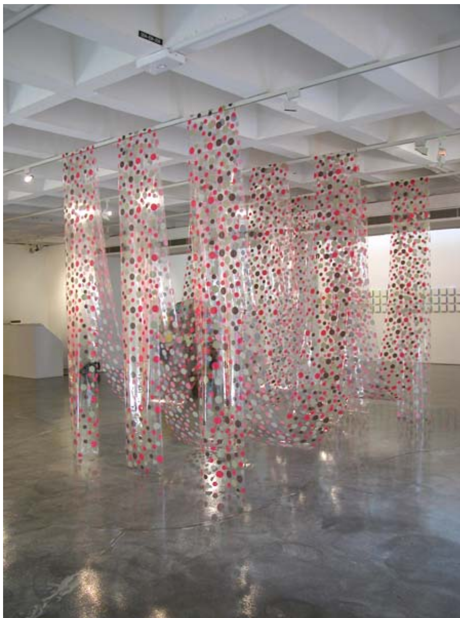
Pam Aitken Volume #7, 2011