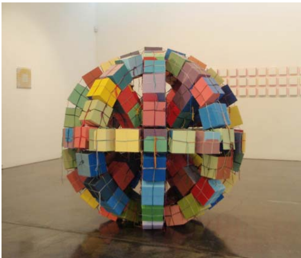
Kate Mackay Round Cube, 2011