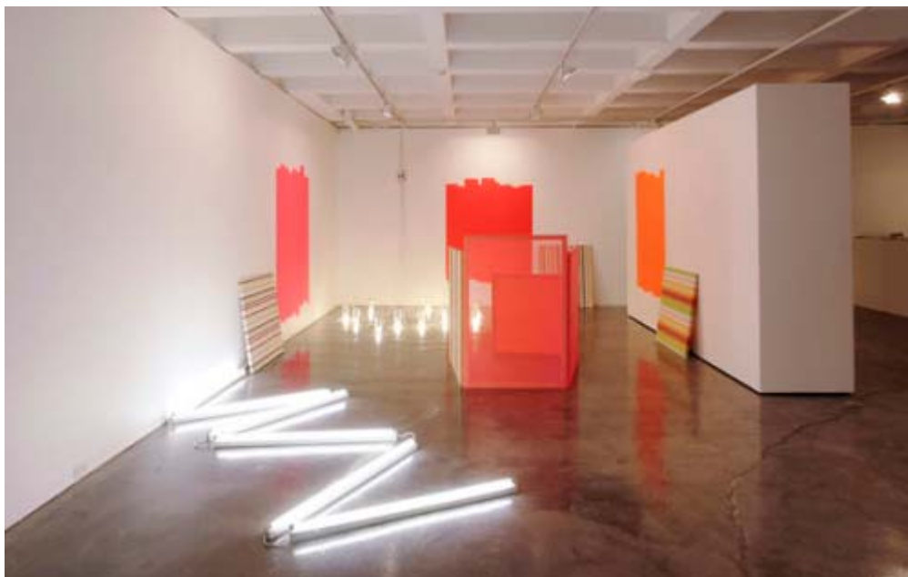
Francesca Mararaga minimalismo (fragments from pink and orange), 2010