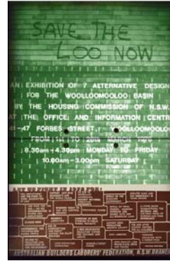
Exhibition install view, 2011