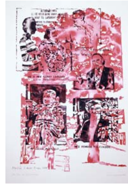
Fiona MacDonald, 'The Tree of Knowledge', 2011. 86 x 50cm.