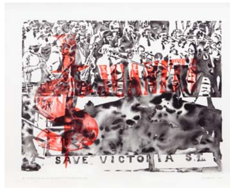
Fiona MacDonald, 'Victoria St: Mick Fowler's Jazz Funeral, 1979; Eviction of 115 Victoria St, 1974', 2011. Big Fag Press.