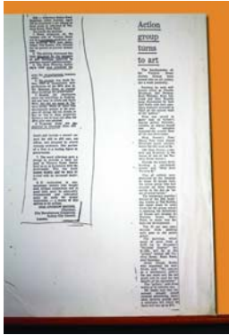
'Action Group Turns to Art', SMH, 1973 (nd).