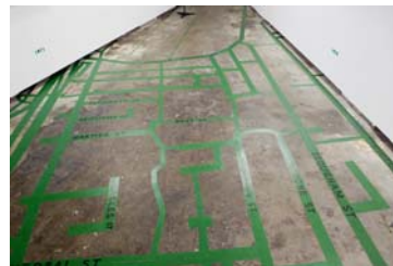
Mickie Quick, Woolloomooloo Map , floor work, 2011. Firstdraft Depot Project Space.