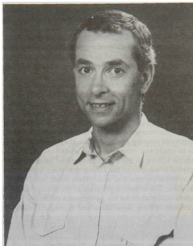
Dr Karl Kruszelnicki (see 'Bizarre Side of Science', column 1)

How to make a Zombie with simple chemicals from your backyard and local beach