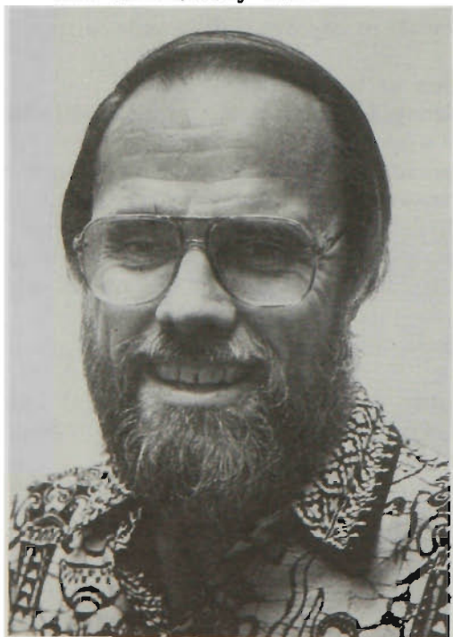
Canadian novelist, Rudy Wiebe

The Apex Foundation for Autism is seeking applications for grants in the area of research to advance the knowledge, treatment or prevention of autism or to