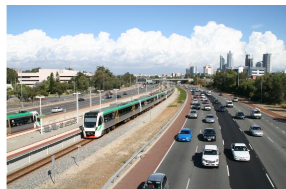
Figure 2 A B series EMU approaching Leederville on Perth's Northern Suburbs Line with part of the Mitchell Freeway and the CBD in the distance