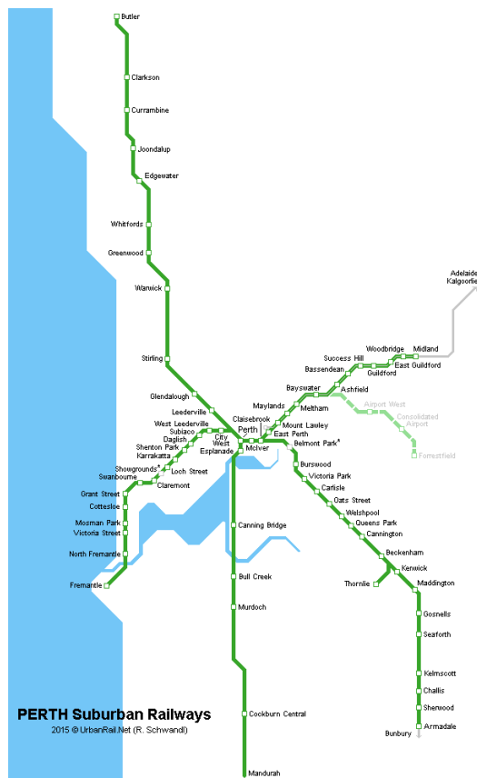
Figure 1 Perth suburban rail network showing future line to the Perth Airport and Forresterfield

http://www.urbanrail.net/au/perth/perth.htm