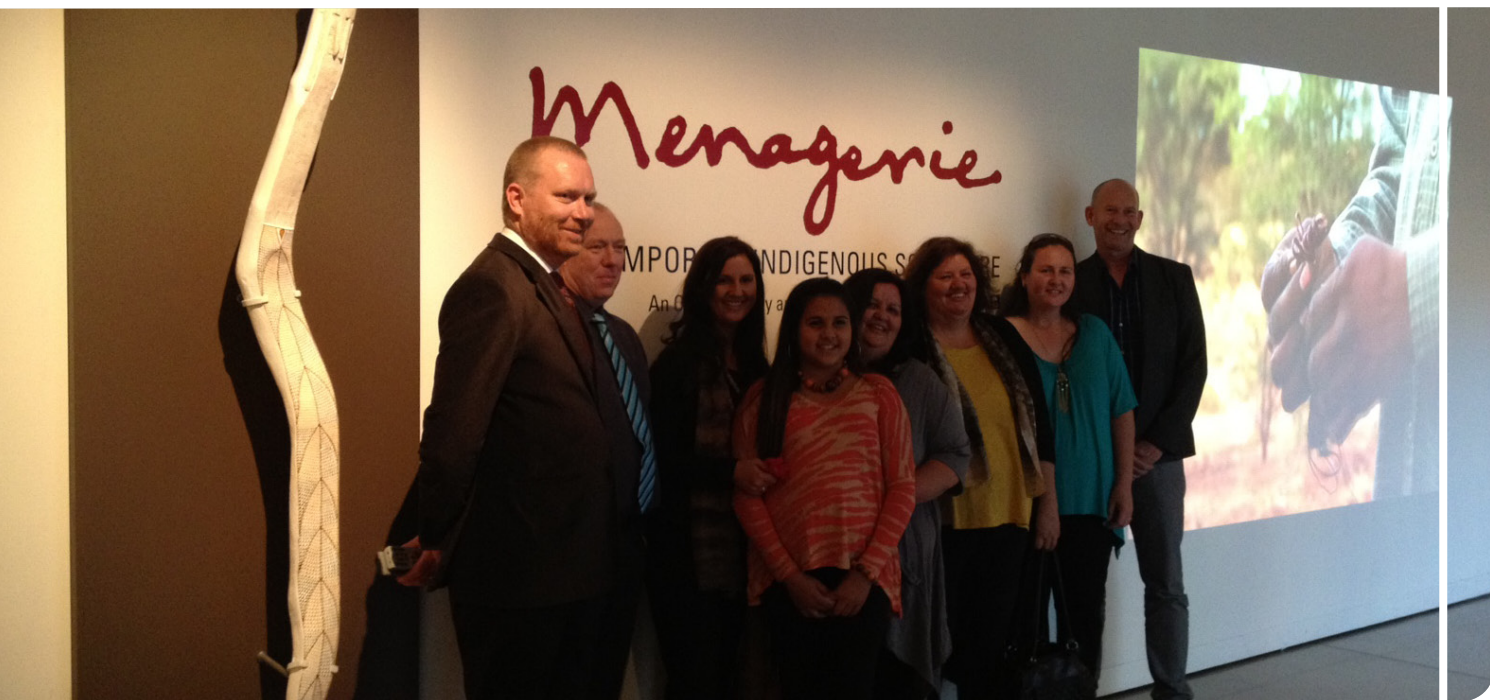
Menagerie: Contemporary Indigenous Sculpture exhibition opening, Western Plains Cultural Centre 2012.

There is a much greater benefit to be gained if all partners in the touring relationship collaborate on the project and have the resources and tools they need to deliver design to the audience.