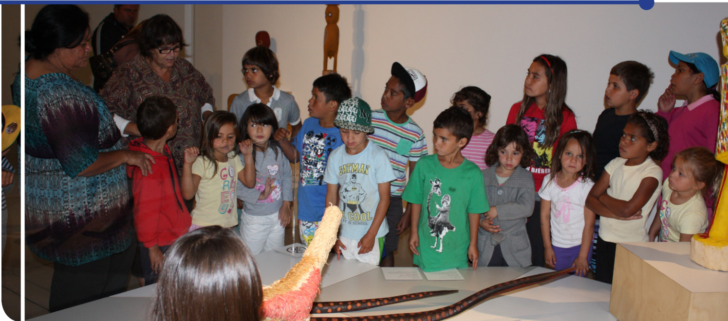
Menagerie: Contemporary Indigenous Sculpture Education visit, Western Plains Cultural Centre 2012.

WPCC, formerly the Dubbo Regional Gallery, has been a venue partner on many Object projects. A very good relationship has been established between the partners. WPCC is always very keen to work with Object, as the staff are confident they will receive quality product. Likewise Object seeks to include WPCC in all its tours as the staff is highly proficient, the venue is excellent and, to ensure that audiences in that part of regional Australia consistently have access to Object's shows.