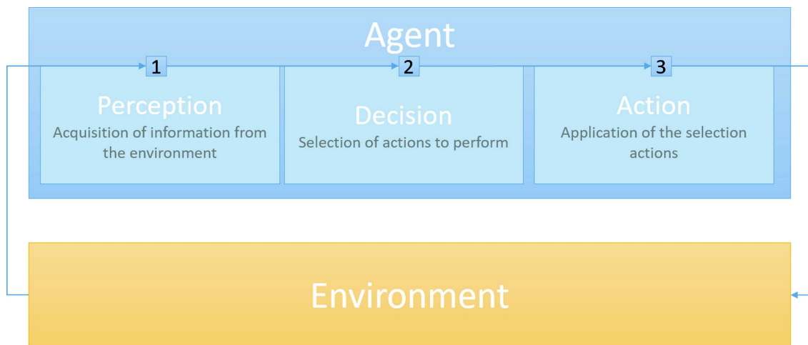
Fig. 2. The lifecycle of an agent [33].