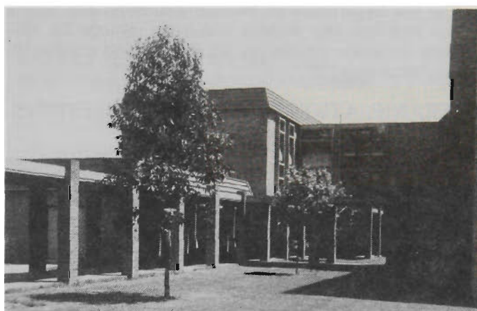
June 1974: eastern courtyard of Austin Keane Building — then the ACS Building

The new University Administration Building was opened on Friday of last week, April 3, by The Hon Stewart West, MP, the Member for Cunningham (NSW) and Federal Minister for Housing and Construction. Mr West was very much at home: his family moved to Wollongong from Forbes in 1941 and he was educated at Wollongong High School. He was elected to the House of Representatives in 1977, was re-elected in 1983 and he was elected to the front bench in 1980. There will be full coverage of the opening in next week's issue of Campus News