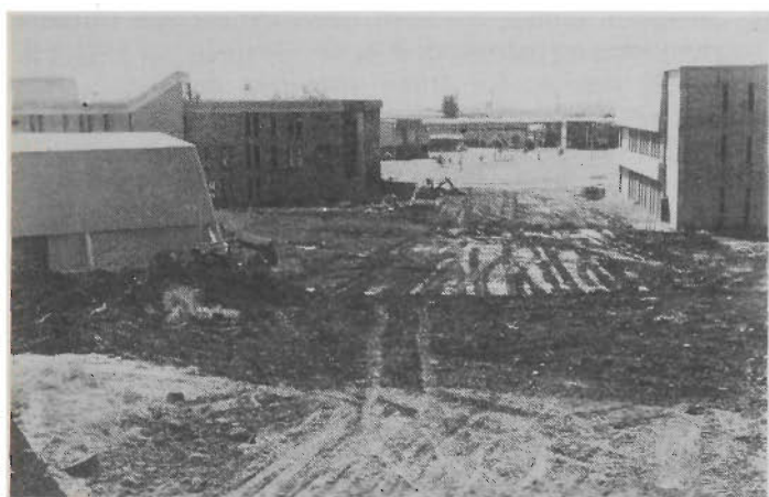
Above: February 1976 — view eastward from the Social Science Building, showing landscaping around Pentagon. Below: corresponding view today