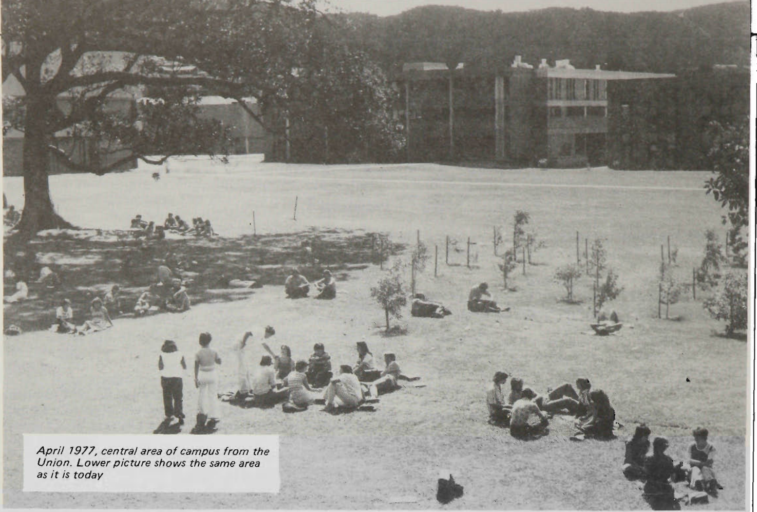
April 1977, central area of campus from the Union. Lower picture shows the same area as it is today

Last Friday, April 3, the University celebrated its 25th birthday by declaring open the new Administration building. The pictures here show the university as it was – and as it is today