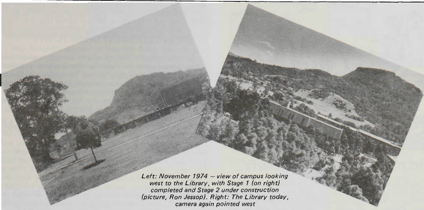
Left: November 1974 — view of campus looking west to the Library, with Stage 1 (on right) completed and Stage 2 under construction. Right: The Library today, camera again pointed west

The new University Administration Building was opened on Friday of last week, April 3, by The Hon Stewart West, MP, the Member for Cunningham (NSW) and Federal Minister for Housing and Construction. Mr West was very much at home: his family moved to Wollongong from Forbes in 1941 and he was educated at Wollongong High School. He was elected to the House of Representatives in 1977, was re-elected in 1983 and he was elected to the front bench in 1980. There will be full coverage of the opening in next week's issue of Campus News