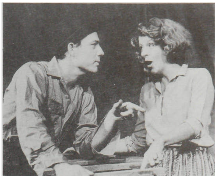
Scene from Theatre South's Twofold Bay

Tonight We Anchor in Twofold Bay plays at The Bridge Theatre, Wednesday to Saturday until November 1. For bookings, phone 296144.