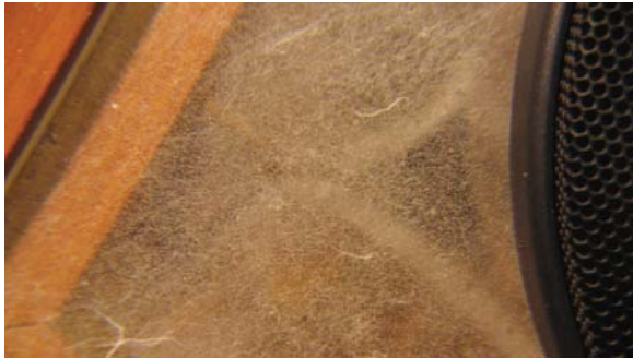
Fig. 3. Construction: close up of bleached mulberry fibres which enhance light absorption properties of the surface

The Orbophone projects light in a variety of ways: