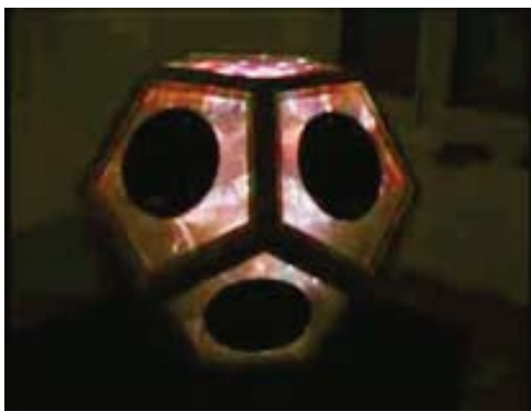
Figure 1 shows the dodecahedral structure of the Orbophone. A loudspeaker is mounted in ten of the twelve pentagonal faces.

Panning rapidly across the surfaces of a three dimensional object seems an appropriate gesture for audio spatialisation. Such a gesture may describe radiation patterns that are omnidirectional or highly directional. The icosahedron form - one of five polyhedrons defined by their congruent regular polygon surfaces and polyhedral angles - was chosen as an enclosure as it can produce a good omnidirectional radiation pattern of sound energy [15]. The dodecahedron with twelve sides is the particular variant of the icosahedron used. Though it roughly approximates a spherical surface, it is economical and capable of delivering a variety of soundfields via individually driven speakers symmetrically mounted on ten of its faces. The top and bottom faces are reserved for image projection and display.