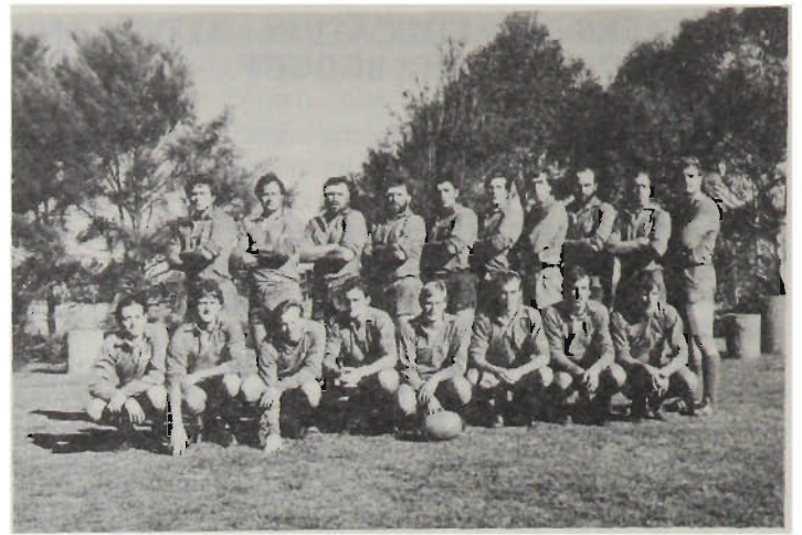
The visitors, looking suitably stern, before the game