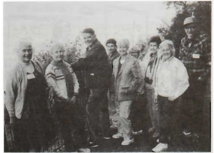
Earlier this month, this Elderhostel group of US visitors is sight-seeing at Mount Kembla

The Australian College for Seniors will be holding 40 three-week programs in Australian and New Zealand Universities and Colleges of Advanced Education from December 1986 to February 1987. Each program will have approximately 40 senior Americans on it and will be