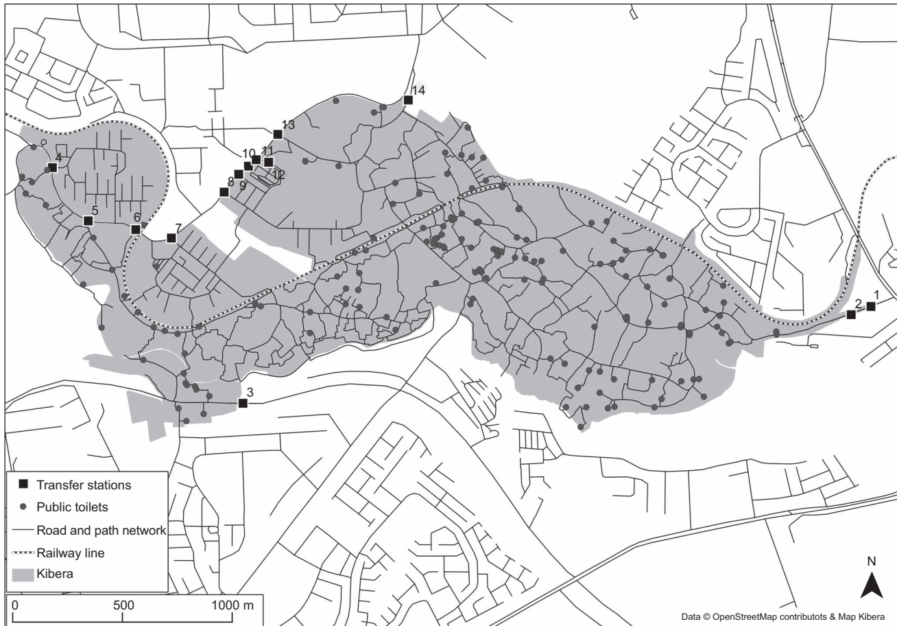
Figure 2. Map showing Kibera settlement, public toilets and locations identified as suitable for transfer stations by the multi-criteria evaluation

weighting for the large tanker journeys increases proportionally for each station by the number of toilets serviced, as described by Equation 2. In this instance, for station 1 to service 88 toilets (e.g. 88 Vacutug journeys) 4.4 large tanker journeys will be required, whereas if station 5 only services one toilet then it can accommodate 20 Vacutug journey's worth of waste before needing a large tanker journey (i.e. a weight of 0.05).