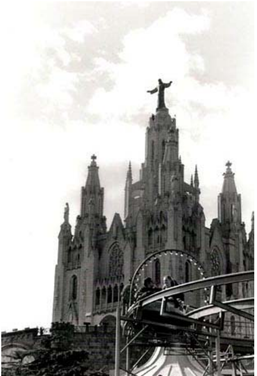
Spanish Cathedral 2, Efrat Arbel