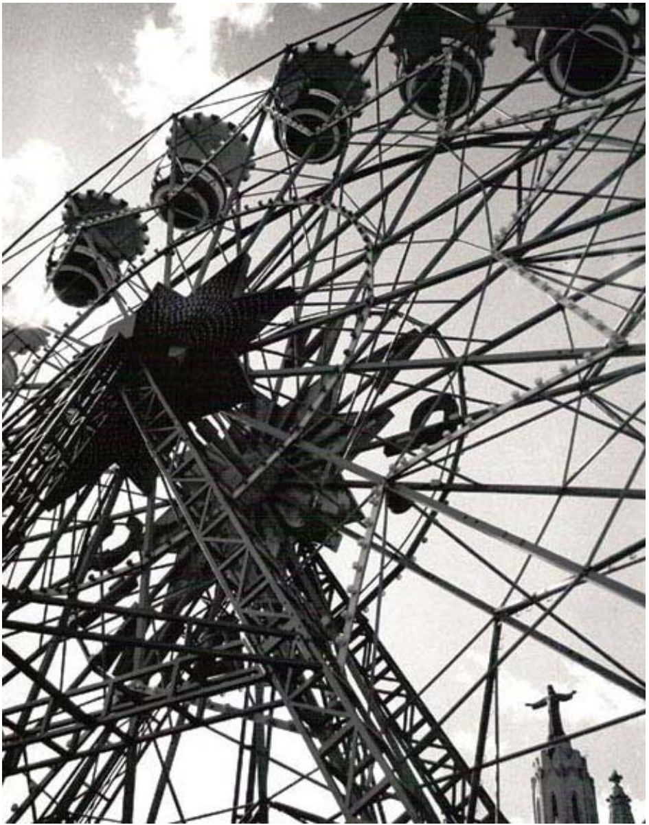
Spanish Cathedral 1 , Efrat Arbel