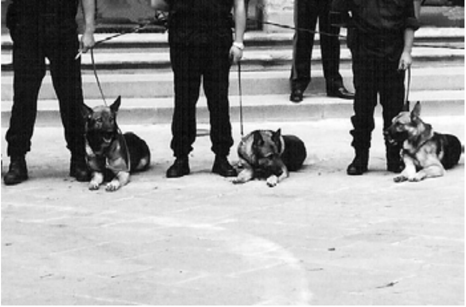
A Rest for Authority , Efrat Arbel