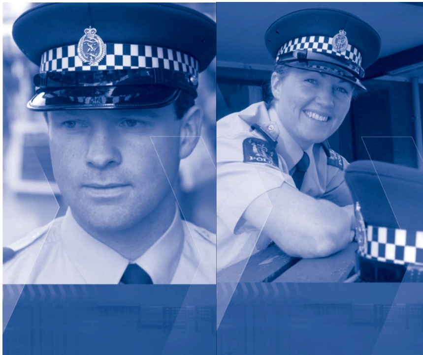
Figure 2 The “Face” of the Force