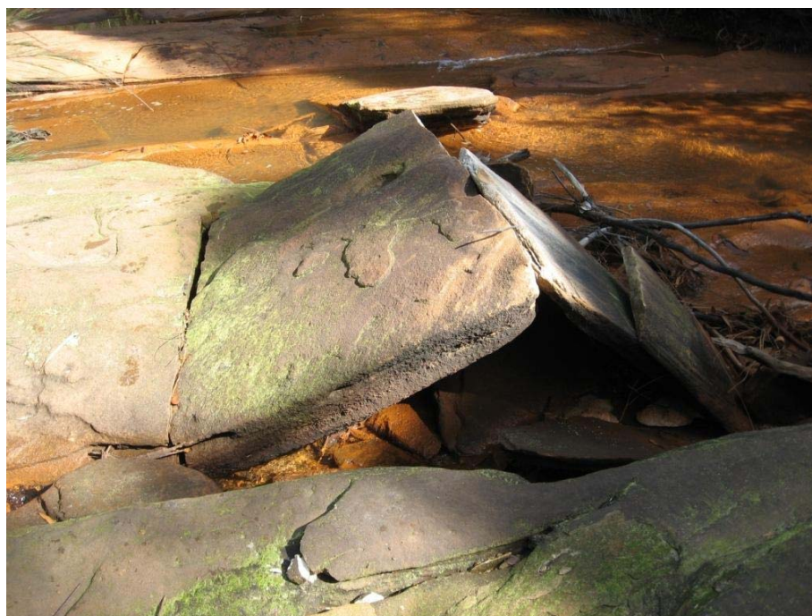
Figure 2 - Buckling of near-surface, Waratah Rivulet, late 2004

Some significant observations regarding valley closure and upsidence are: