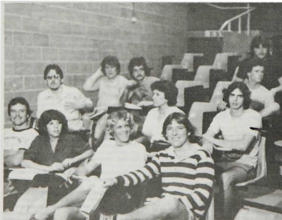
Some of the American students on campus.

The "holiday" is over in more ways than one for 15 American exchange students at Wollongong University.