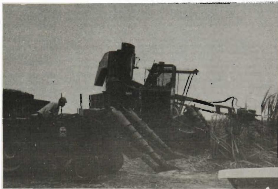
Above: Complex Australian Harvester in background, section of simpler Barbados system in foreground. Below: Woman loading hand-cut cane.