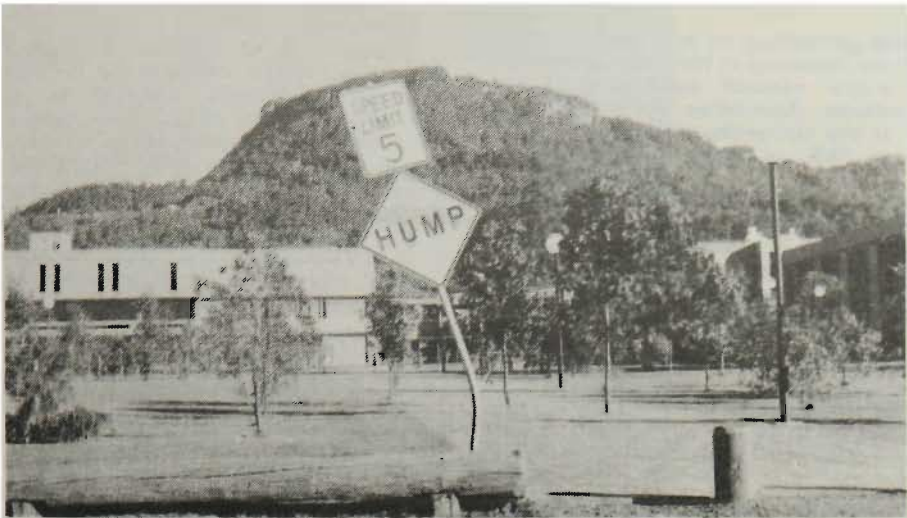
Left: From Top.