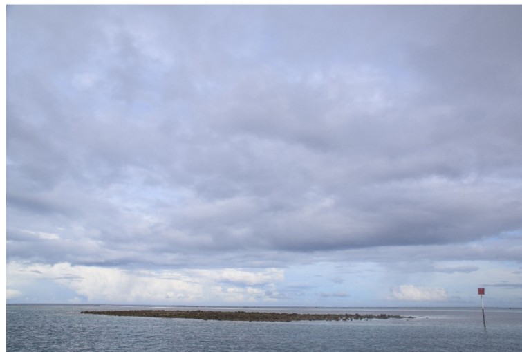
Figure 7. Rarata Island in Langalanga Lagoon.

9 m (!) storm surge that flooded the artificial islands in Langalanga in 1966 [59]. A year later, in 1967, cyclone Annie destroyed houses and coconut plantations in North Malaita, and in 1972, tropical cyclone Ida caused massive devastation in the province and encouraged landward migration [35]. Several artificial islands in Langalanga Lagoon, such as Rarata Island, were permanently abandoned after cyclone Namu in 1986, the worst tropical cyclone to have affected Solomon Islands on record (see Figure 7). It illustrates that tropical storms have always been an integral part of life for coastal communities in the archipelago [60]. In fact, cyclones also create opportunities: The village of Abitona in East Malaita was built on a sandbank created by a severe cyclone in the 1920s. The new land proved attractive to settle on, particularly as there were no existing land claims. Nowadays, the village is flooded by king tides in December and January, but whether this is a new phenomenon or caused by climate change, soil compaction, the cutting of mangroves, or a combination of these factors, remains unclear.