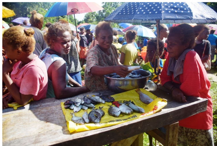
Figure 2. Women barter fish for root crops in Lau Lagoon.

The distinction between wane asi (saltwater people or to’aiasi) and wane tolo (forest people or to’aitolo) is a salient feature of human ecology in Melanesia [17,18]. The wane asi are fishers who barter fish for root crops and vegetables with the wane tolo, shifting cultivators who inhabit the forested interior of Malaita (see Figure 2). This distinction is not absolute. Nowadays, many wane asi maintain agricultural plots and many wane tolo are fishing, and intermarriage is common [19]. Nonetheless, many communities continue to identify themselves as wane asi: The livelihoods, worldview, and identity of these people revolve around fishing and the sea.