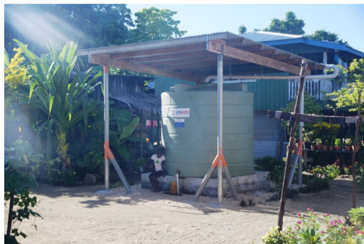
Figure 11. Rainwater storage tank on Kwai Island (J. van der Ploeg, 2017).