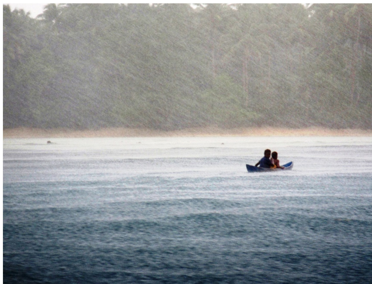
Figure 10. Children on their way to school.

Heavy rains can make the daily canoe trip to school hazardous for children (see Figure 10). During the koburu season, women have difficulties travelling to the market. Many wane asi have therefore opted to relocate to the mainland.