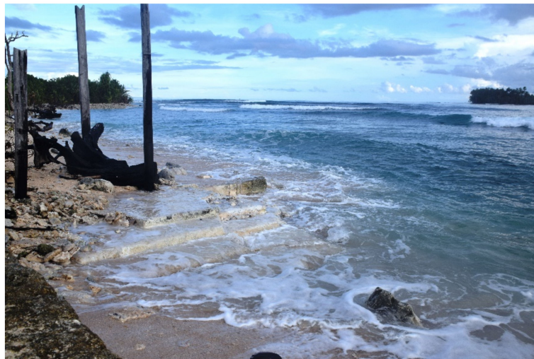
Figure 4. The remains of the Anglican church of Fanalei (J. van der Ploeg, 2018).

A closely affiliated ethnic group are the Kwai, who live on two densely populated islands on the East coast of Malaita: Kwai and Ngongosila. People here speak Guala'ala'a, which was used as a trading language along the coast [21]. Reliable census data is lacking but it's estimated that around 900 people live in these two communities. The saltwater people from Kwai and Ngongosila, and several other small artificial islands scattered around Uru Harbor, trade fish with the Kwaio people from the uplands. Ngongosila was settled in 1955 when the South Sea Evangelical Mission built a church on the island [29].