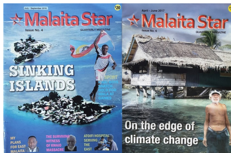
Figure 1. The sinking islands of Malaita (Malaita Star, 2016, 2017).

Similar claims are regularly made in science, policy, and development discourses. There is broad scientific consensus that people on low-lying islands in the Pacific are highly vulnerable to future climate-induced sea-level rise, and that there is an urgent need to invest in adaptation mechanisms [2,3]. But little is known about how local people in remote rural areas, such as Malaita, perceive and deal with climate change [4,5]. Rebecca Monson and Joseph Foukona [6] write in an edited volume on climate displacement that the wane asi in Lau Lagoon increasingly have to cope with changing wind patterns, extreme weather events, and coastal erosion: