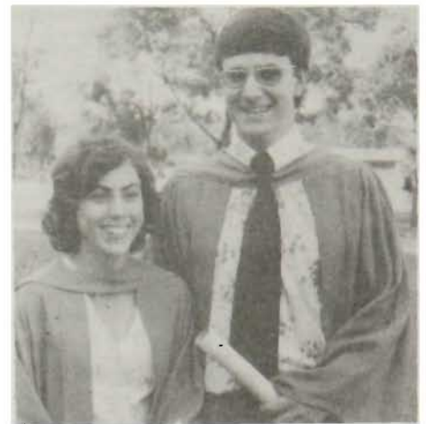
A HUSBAND and wife graduated with Bachelor of Science degrees.