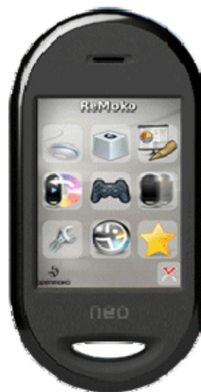
Figure 1. The Neo FreeRunner Linux Phone.

The Linux environment is more suited to the development of new applications in embedded hardware than the j2me environment which had previously been used by the first author for developing musical applications [4, 5, 6].