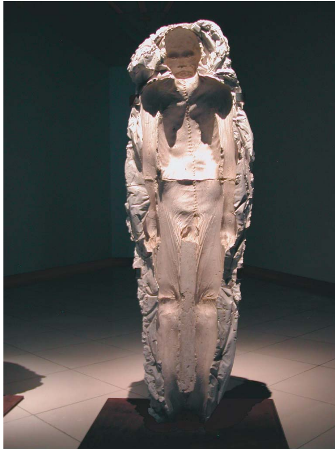
Figure 4 Teresa Margolles SEMEFO Catafalco / Catafalque, 1997 Adhesion of organic materials on gypsum.