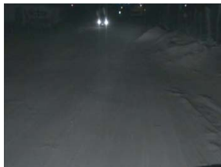
Figure 16 Teresa Margolles Lote Bravo, Lomas de Poleo, Anapra y Cerro de Cristo Negro, 2005 Video Stills of video (4 images) Courtesy of Teresa Margolles and Galerie Peter Kilchmann, Zürich.