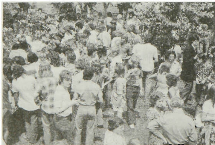
STUDENTS mill around the food-and-drink areas during the Clubs and Societies Orientation Week Barbecue on February 25.

But at Wollongong the University not only included the Council but also, among other bodies and persons, all the students.