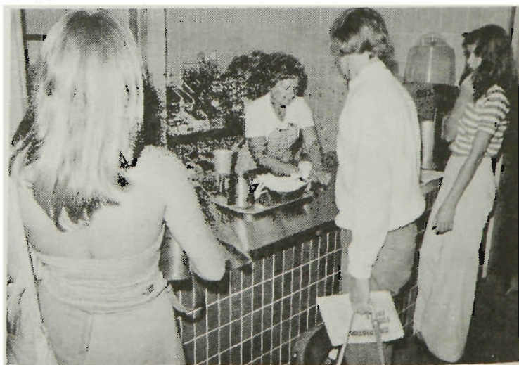
STUDENTS taking advantage of the service provided at the Coffee Bar adjacent to the Members' Bar and the Southern Lounge in Stage 111 of the University Union.