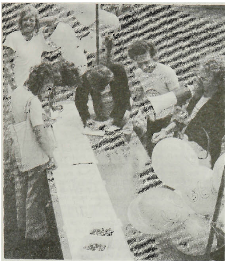
FREE balloons and sweets were used to attract prospective members by the Geological Society during the Clubs and Societies Orientation Week Barbecue on February 25.