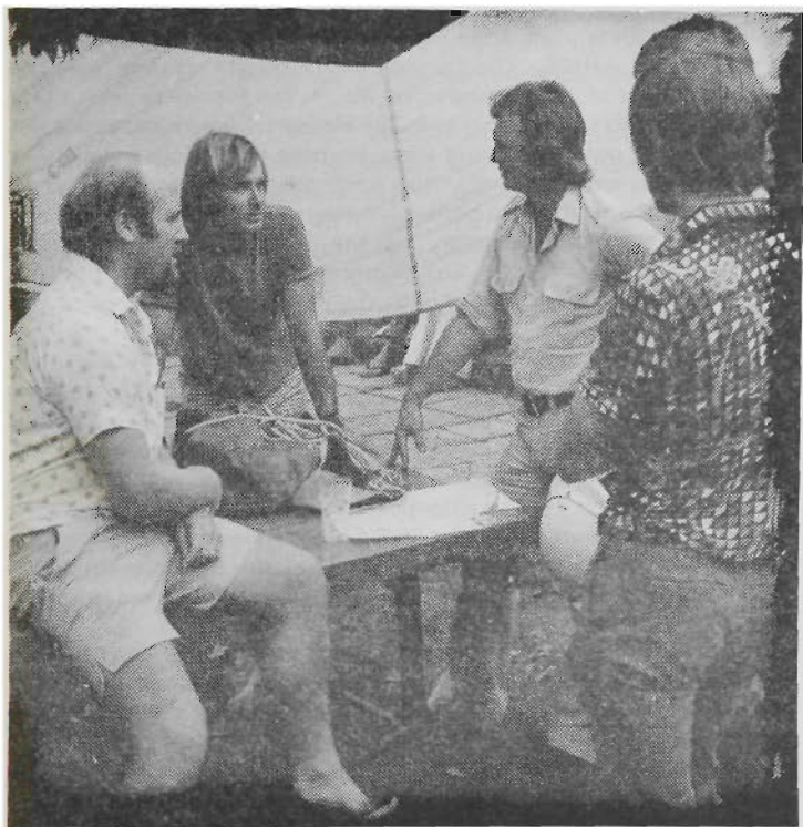
A SAIL was used as a backdrop to the Sailing Club's display area during the Clubs and Societies Orientation Week Barbecue on February 25.