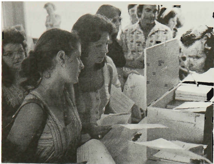
FIRST-YEAR students receive their enrolling papers at the Enrolment Centre in February