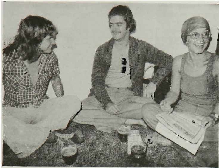
HAPPY customers relaxed on the floor of the Members' Bar, in Stage 111 of the University Union, when the bar opened for business on February 23.