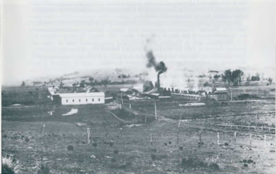
UNANDERRA COKE WORKS begun in 1888 seen from Cobblers Hill. They stood beside the Illawarra Railway and Five Islands Road.