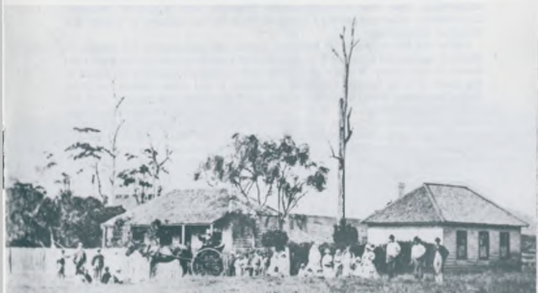
CHARCOAL CREEK DENOMINATION SCHOOL with teacher's residence on the left.