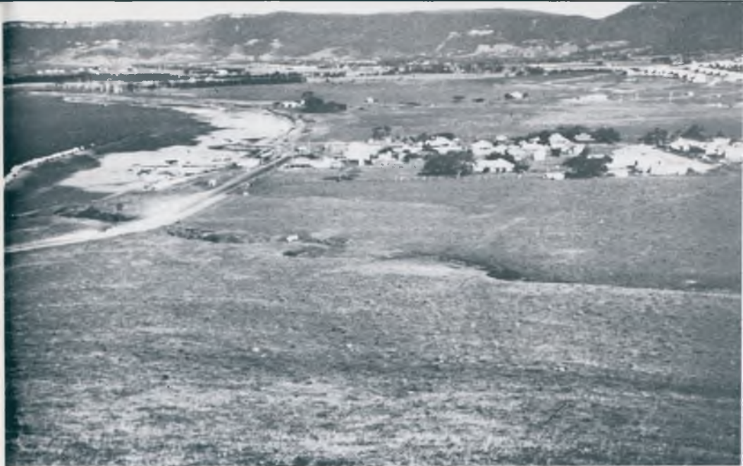
THE BERKELEY FISHING VILLAGE IN 1957 as the housing expansion began. The little harbour in Lake Illawarra for the fishing boats is on the left.