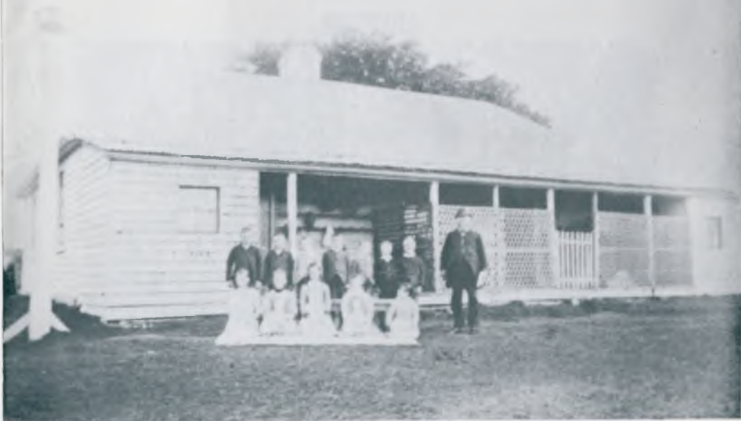
THE FIRST BERKELEY PUBLIC SCHOOL at the corner of Flagstaff Road and Lake Avenue about 1890. The school was later demolished and the site abandoned.