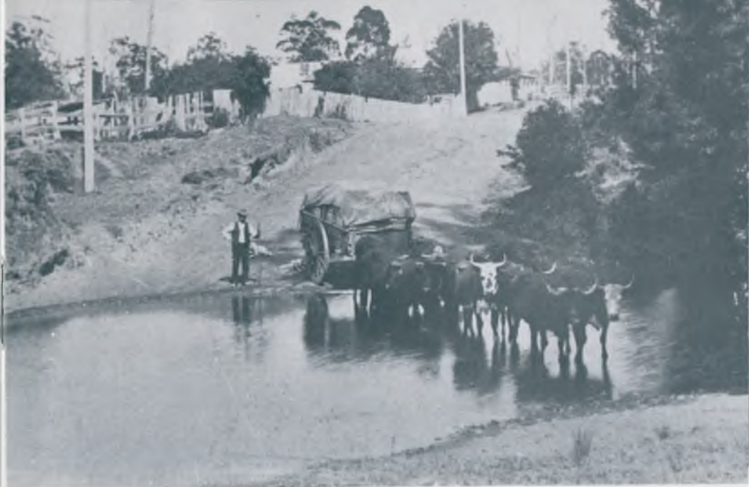
BULLOCK TEAM WITH CART crossing Charcoal Creek on the main road at Unanderra. The Unanderra Public School and residence can be seen in the background.