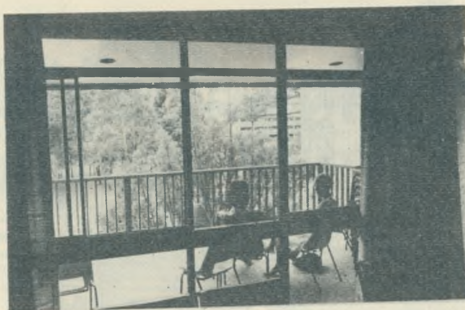
View from the new Northern Lounge balcony.

Towards the end of 1984 upgrading of the Institute Canteen was commenced with a view to creation of a major new catering outlet for the campus for the beginning of the 1985 academic year.