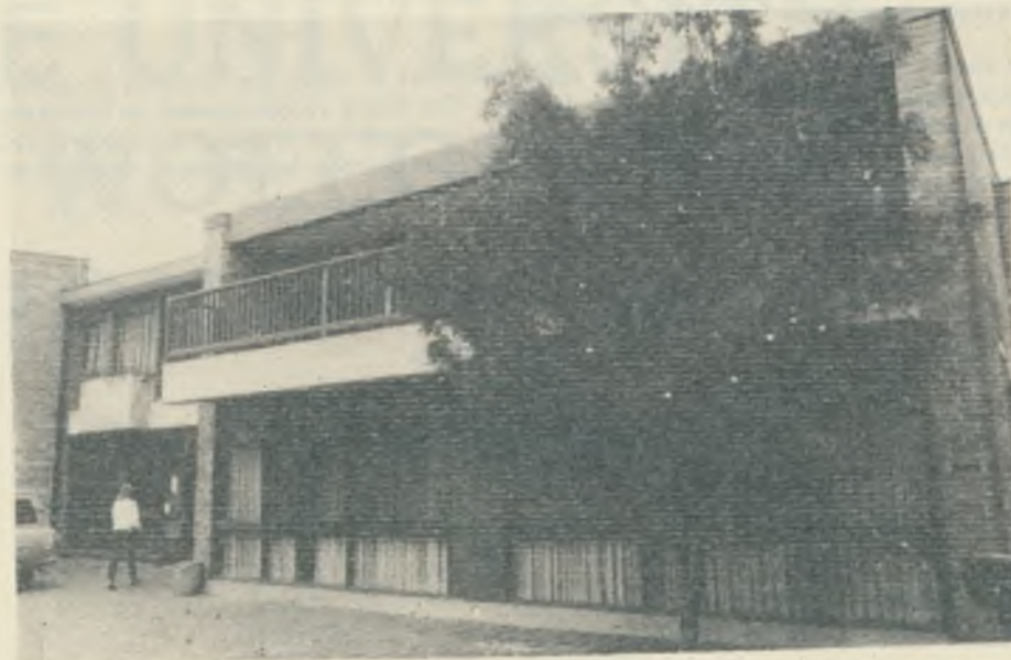
The northern side of the Union building showing the Dining Room extension, the new Northern Lounge balcony and new Board Room.

A Commander telephone system was installed in December because of the inadequate nature of the old switchboard.