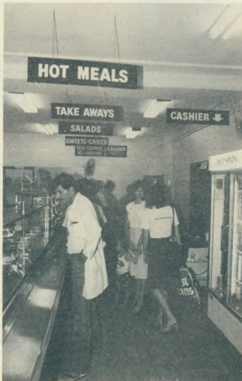
The re-designed Cafeteria-servery

During the year a new Board Room was constructed on the old Northern Lounge balcony, allowing the former Board Room to be converted into much-needed additional office accommodation. The Table-Tennis room was converted into offices for the Sports Association and the Squash Courts foyer and staircase area was upgraded as part of the process of establishing a new operational base for the Sports Association.