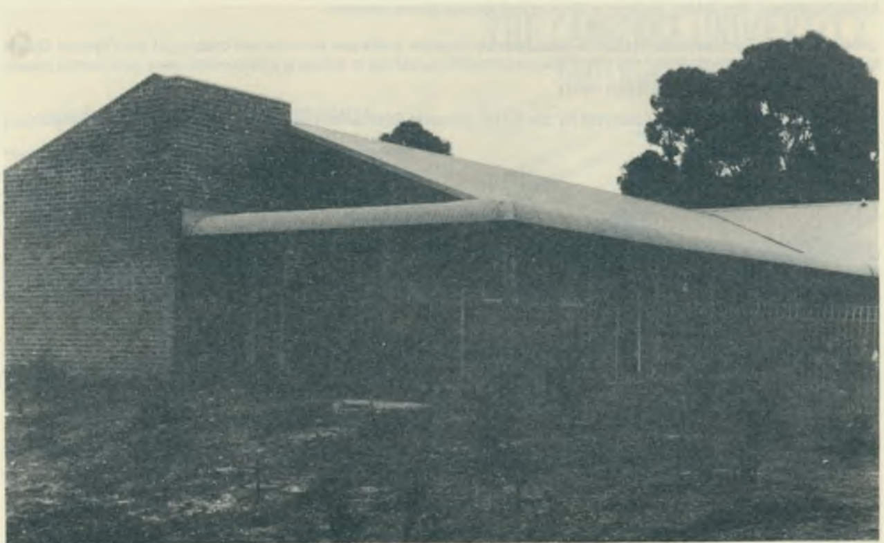
Stage II of the Childcare Centre opened in 1984.