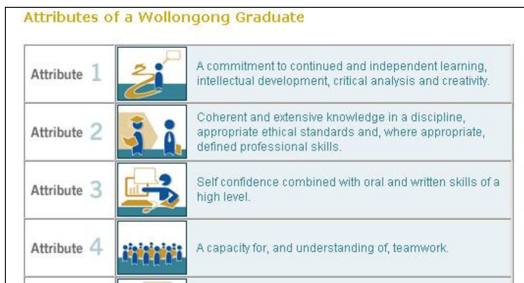
Figure 2: Iconic representations for four of the attributes

Each icon represented in Figure 2 is then hyperlinked to related teaching strategies as shown in Figure 3. The website has been designed to demonstrate the interrelationship between explicit teaching strategies and the fostering of attribute development by encouraging teachers to explore how they are implemented in other discipline areas. This sharing of strategies across and within faculties is supported through a navigation structure that allows teachers to either view examples for a particular attribute or for a particular faculty s, as demonstrated in Figure 3.