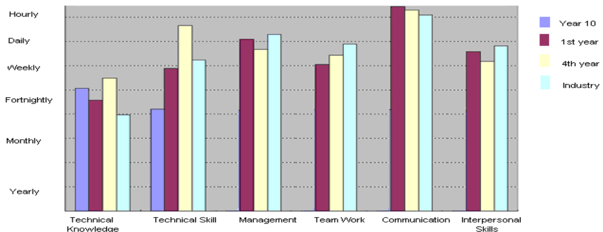
Figure 1: Frequency mean of functional themes of year 10, first year, fourth year and industry.

Before beginning the analysis, we grouped the 39 tasks into six functional themes. We grouped aspects related to engineering science and problem solving as technical knowledge, aspects related to practical engineering skills as technical skills, aspects related to engineering project management as management, aspects related to working with different people, sharing information and work towards a common objective as teamwork, aspects related to building social relations and communicating the problem as communication, and finally aspects related to coordinating and interacting with people as interpersonal skills. Grouping responses into functional themes made it easier to perceive overall patterns in the perceptions of participant groups. Year 10 students only rated tasks that were categorised into the themes of technical knowledge and skills.