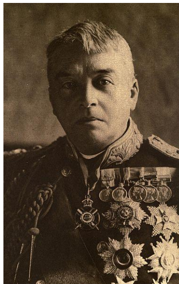
John Arbuthnot Fisher, 1st Baron Fisher

defending the Empire was a substantial cost to Britain and, for the Asquith government, all parts of the Empire should contribute to the maintenance of one navy under one command. Colonel Foxton responded that Australia wanted its own portion of Imperial naval defence not some 'isolated small naval squadron' that could be 'fossilised', 429 which included not only the interchangeability of officers and men, but also of vessels to ensure an equal standard of training, maintenance and efficiency. Foxton and Creswell advanced arguments based on fiscal, procurement and workforce capability.