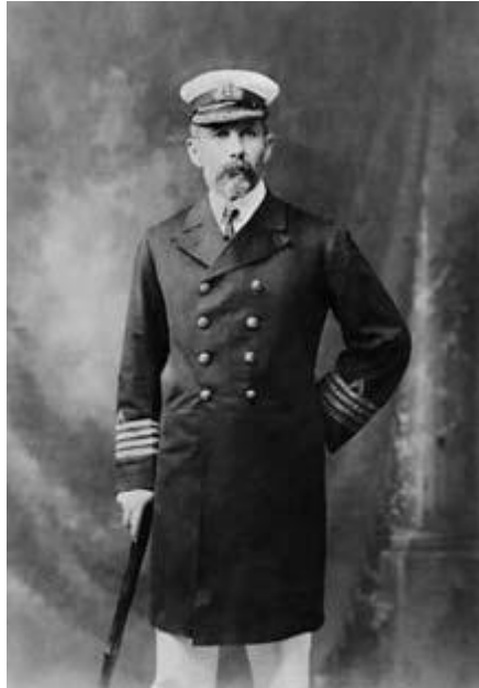
Captain Creswell as Commandant of the Queensland Naval Forces, 1900, from the Naval Historical Collection, Australian War Memorial (POO.444.162)

disparagingly informed the Admiralty that ‘it only showed that she could be navigated to China and back at economical speed by her officers and crew.’ 92