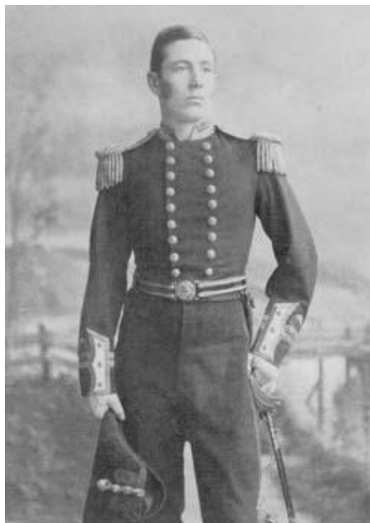
Lieutenant William Rooke Creswell

for war, but to influence and preserve peace, protect sea commerce and permit free movement of goods and people across the seas. It did so in the form of small, shallow draft vessels, which could work close to shore and access coastal rivers systems, commanded by junior naval officers. ‘This was, perhaps, the last era in history when, unfettered by global communications, the junior officer could exercise his initiative to the full in the Hornblower tradition.’ 29