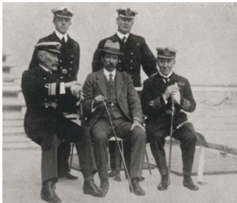
Australia's First Naval Board.

authorship of the Report on The Naval Defence of Australia (1913) and Post Bellum Naval Policy for the Pacific (1915) provided prophetic warnings for World War I and World War II regarding Japan. Creswell transferred his responsibility for naval intelligence to Thring, who had hoped there would be an exchange of intelligence information with the Royal Navy. The Admiralty rejected this favouring a lower level exchange between the Royal Australian Navy and the Royal Navy's China Station.