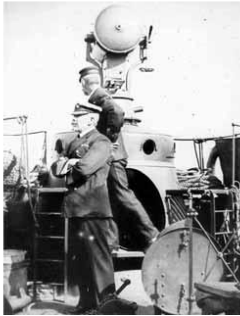
Captain Creswell observing the Commonwealth Naval Forces manoeuvres, Easter 1905 aboard the torpedo boat Countess of Hopetoun

Squadron to engage the enemy, only to be sunk/destroyed/defeated. It was a great opportunity for Creswell to promote his naval doctrine and preview the value of his scheme outlined to Treasurer Turner on 7 June and to Defence Minister Playford in October.