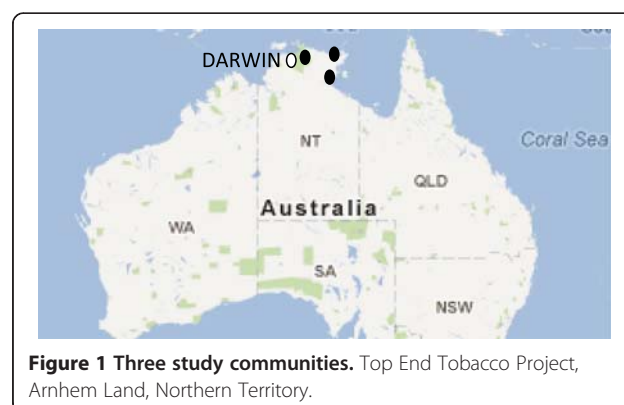
Figure 1 Three study communities. Top End Tobacco Project, Arnhem Land, Northern Territory.

The research reported here is part of the 'Top End Tobacco Project' (TETP), a five year multiple-component, community-action intervention study to reduce tobacco smoking in three remote Aboriginal communities in Arnhem Land, a region east of Darwin in the NT's 'Top End' (Figure 1). The communities have populations ranging from around 800 to 2100. Tobacco is locally available from a small number ( n=10 ) of community-based retail outlets. They are discrete and isolated communities, cut off from each other and the main regional centres in the NT's 'Top End' by sea or by wet season river rises. Socially, culturally and