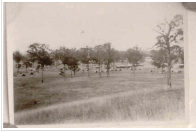
Tents in the bush Narellan Military Camp 1942