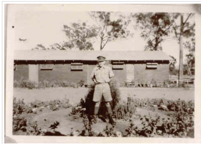
Camp Admin block Narellan Military Camp 1942 A Bailey

The 30 yard small arms range was located in a 'disused quarry at the foot of water tanks on the right of the road from Camden to Narellan'.