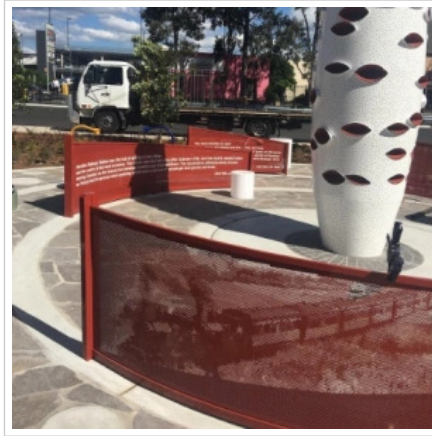
Stylised Elderslie Banksia, extracts from Narellan story and Pansy the Camden train 2016 ( http://dictionaryofsydney.org/entry/narellan )